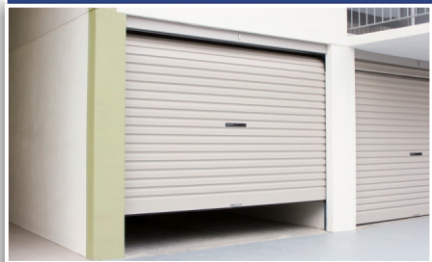
A Flex-A-Door can be left open at any height for ventilation or pet access