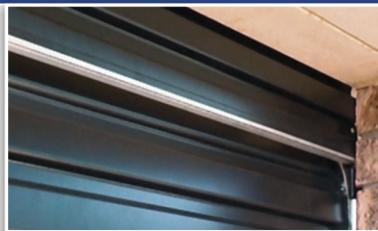
The retractable head infill panel reduces draughts and looks good