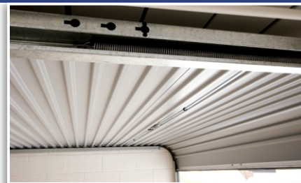
The extension springs are well out of the way of children for safety