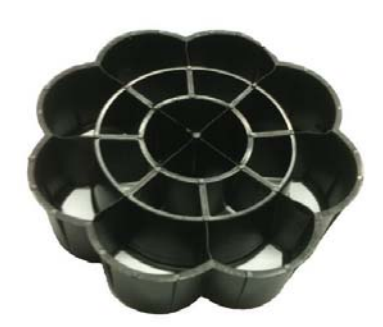
One of the media discs

Also within the aeration chamber is a large amount of 'media'. This media takes the form of large unusually shaped plastic discs. These discs bounce and float around in the circulating aerated wastewater providing extra surface area for the digesting bacteria to live on which increases the level of aerobic bacteria (bacteria with air) present in the chamber and in turn speeds up the rate at which the system can process the waste within.