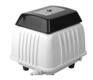
The Gardner Denver diaphram air

compressor utilised in the system for circulating airflow into the second stage of the process provides between 60 and 100 litres per minute of air flow depending on blower size used. The air is diffused from the bottom of the vessel to aerate the contents, catalysing the digestion of remaining solids.