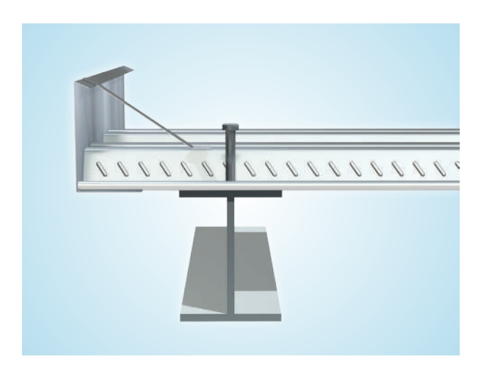
Figure 4: Typical edge form profile layout with cantilever – edge form held square with restraint straps