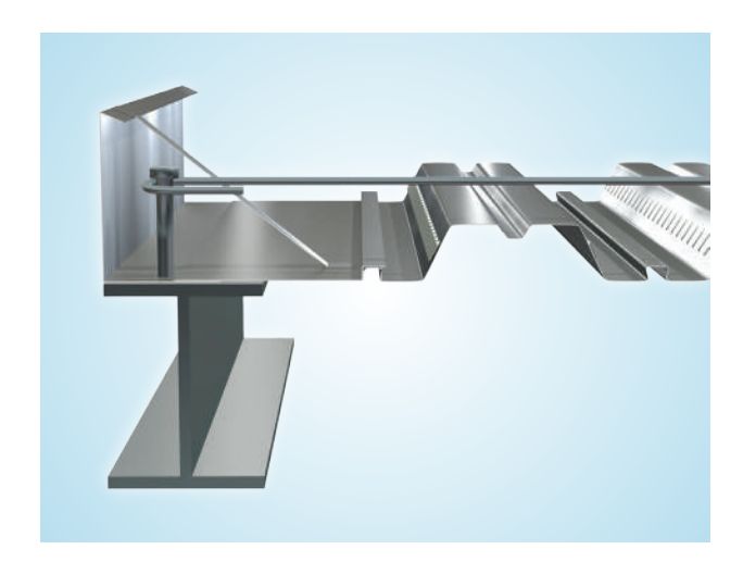
Figure 2: Last trays using closure plate, Z-flashing