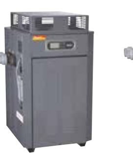
Residential Pool Heater Model 200