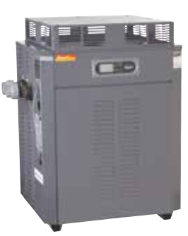
Residential Pool Heater Model 430