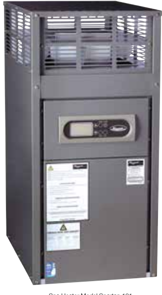
Spa Heater Model Spartan 131