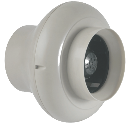
Simx 150mm Inline Fan