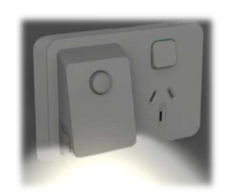
Soft Start LED light