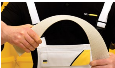
A bend test demonstrating the extraordinary elasticity and resulting high-crack resistance of StoArmat render.